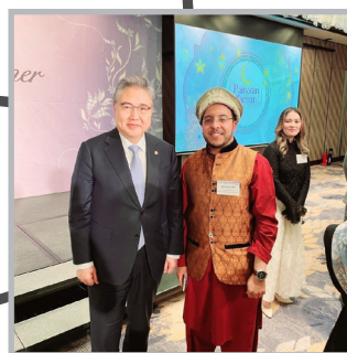
Daejeon being Champions for Inter Korea Cricket Tournament / leading Muslim Community in KAIST / With Korea Foreign Minister, His Excellency Park Jin for MOFA invitation to Ramadan Fasting