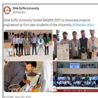
Leading BAQRIX as lecturer and mentor in DHA Suffa (2017-19)

Remember, your past failures serve as valuable lessons, guiding you toward personal growth and resilience. The present is an opportunity to learn from those lessons and work towards self-improvement. As you continue your journey, never lose sight of the remarkable achievements that await you in the future. Believe in yourself, embrace positivity, and let your light shine brightly, inspiring others along the way.